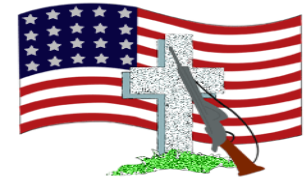
ALL GAVE SOME, SOME GAVE ALL