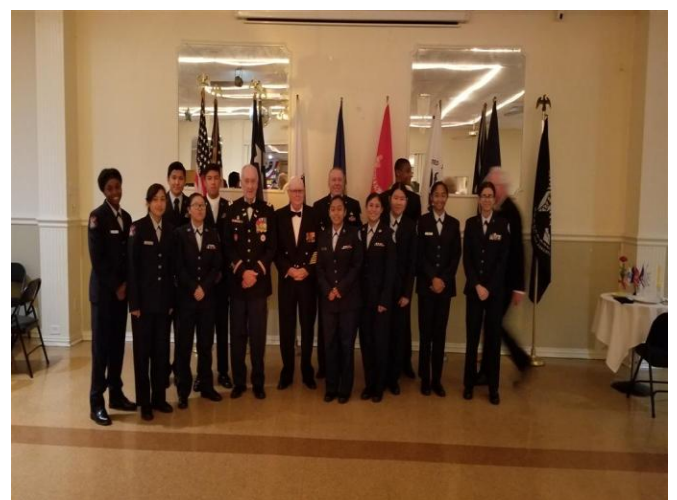
MANSFIELD TIMBERVIEW H.S. AFJRROTC