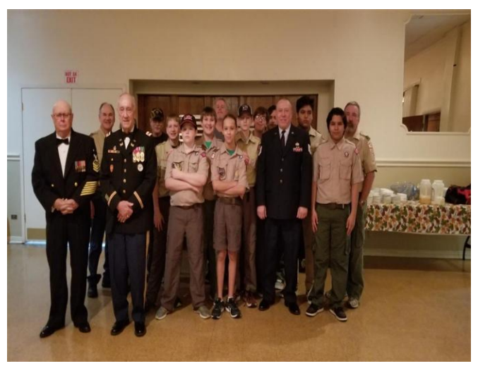
BOY SCOUT TROOP 396