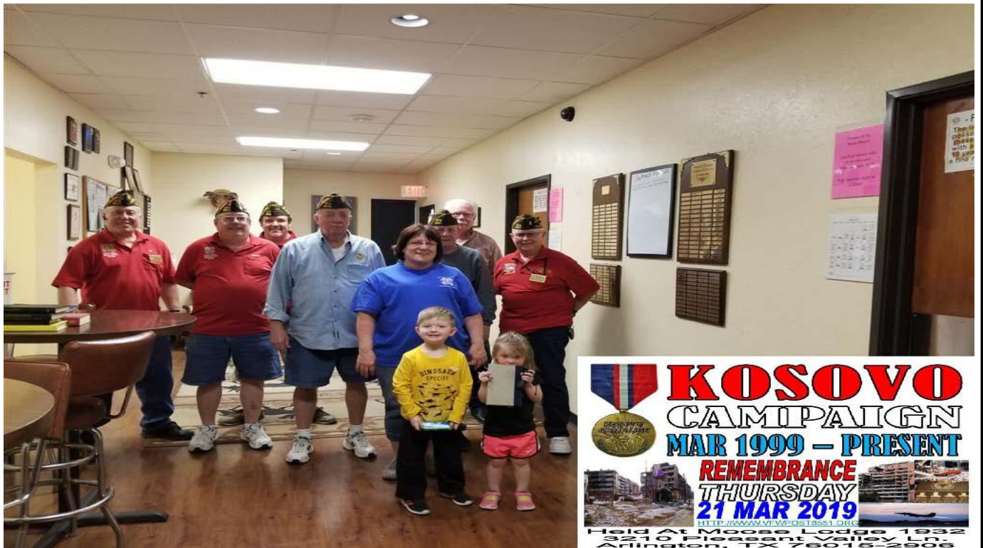
20190321 KOSOVO VPR