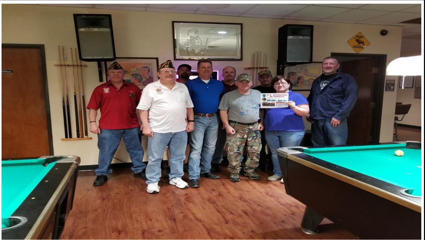
20190320 SOMALIA VPR