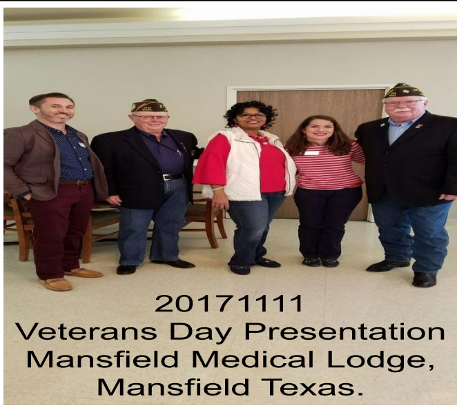
20171111 Veterans Day Presentation Mansfield Medical Lodge, Mansfield Texas.