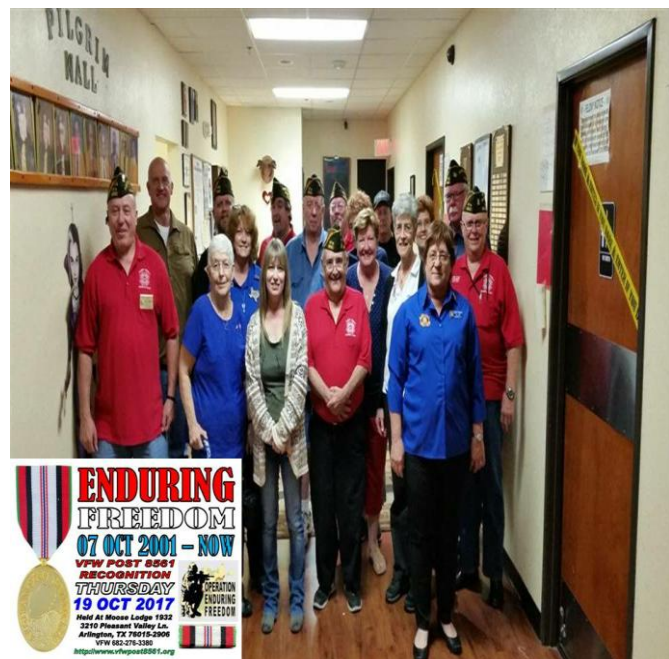
20171019 OPERATION ENDURING FREEDOM REMEMBRANCE