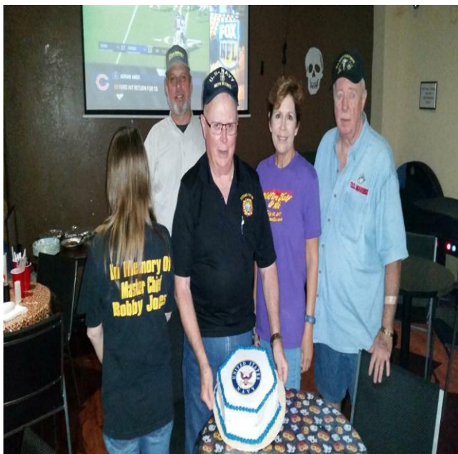
20171015 U.S. NAVY BIRTHDAY CELEBRATION