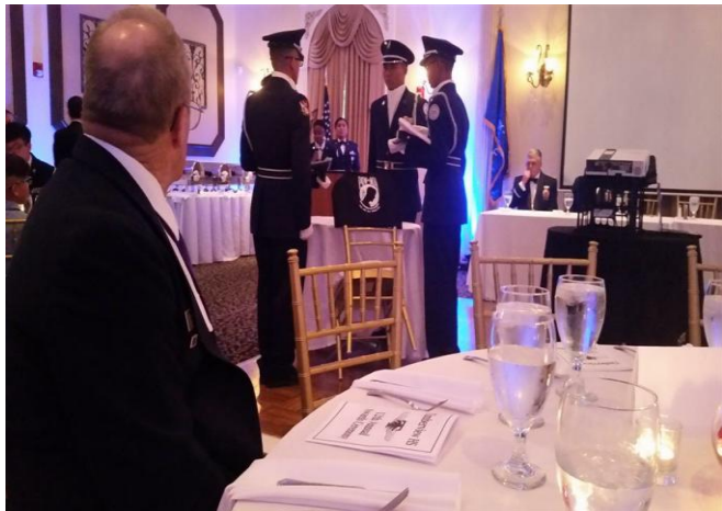
JR ROTC CADETS POW CEREMONY

Timberview High School AFJROTC "Wolf Group"