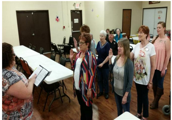
2017-2018 VFW AUX OFFICER INSTALLATION