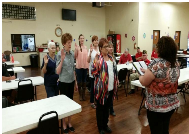
2017-2018 VFW AUX OFFICER INSTALLATION