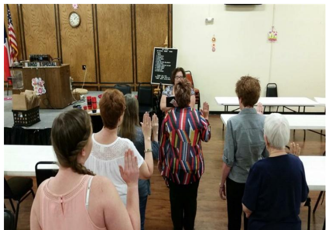
2017-2018 VFW AUX OFFICER INSTALLATION