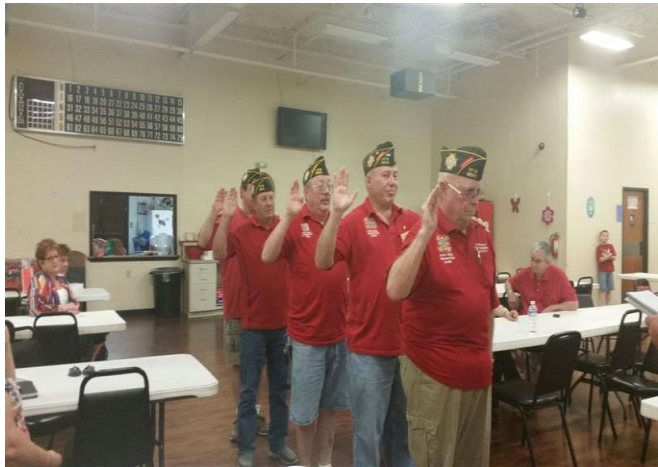
2017-2018 VFW OFFICER INSTALLATION