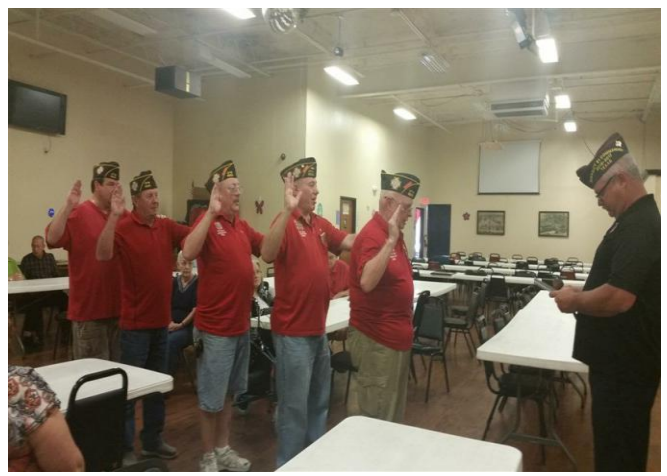
2017-2018 VFW OFFICER INSTALLATION