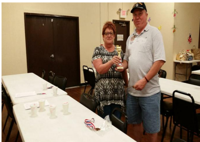
20170422 CHILI COOKOFF 1ST PLACE NO BEANS