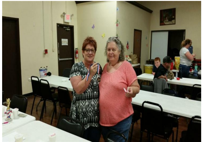
20170422 CHILI COOKOFF 3rd PLACE WITH BEANS