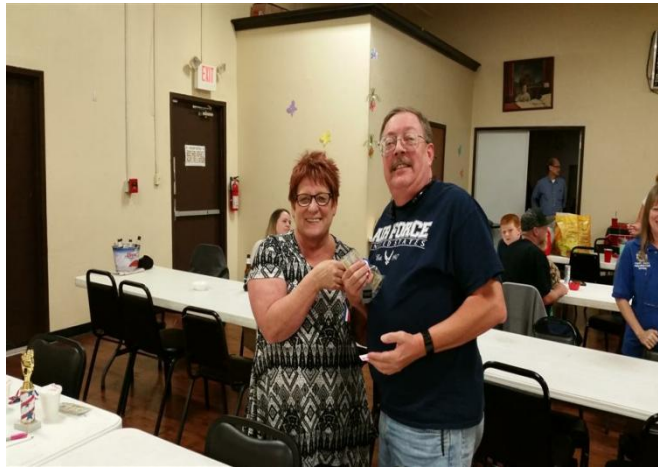
20170422 CHILI COOKOFF 2nd PLACE WITH BEANS