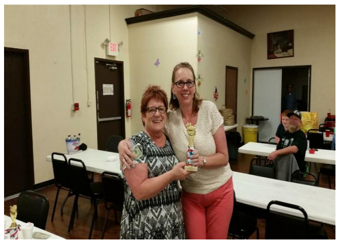
20170422 CHILI COOKOFF 1ST PLACE WITH BEANS

SPONSORED BY: VFW POST 8561 & AUXILIARY (682)276-3380 info@vfwpost8561.org