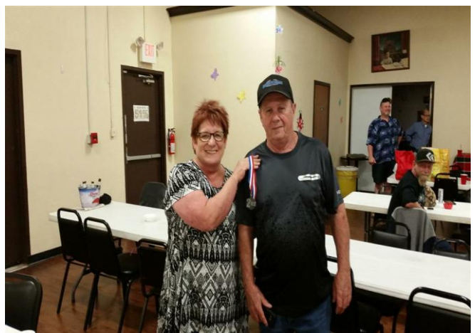
20170422 CHILI COOKOFF 2nd PLACE NO BEANS