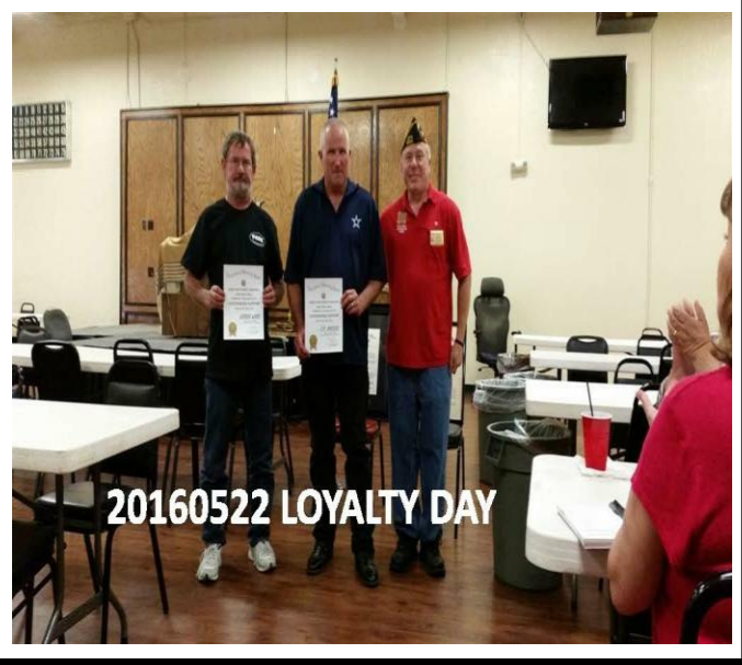
20160522 LOYALTY DAY