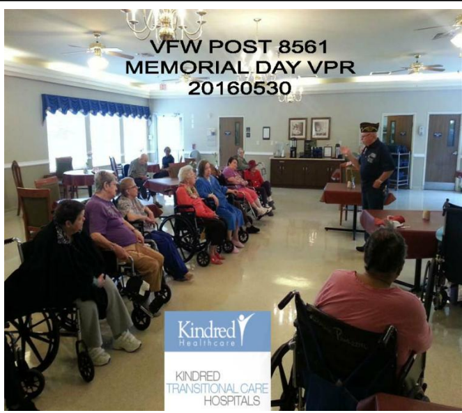
VFW POST 8561 MEMORIAL DAY VPR 20160530

Kindred Healthcare KINDRED TRANSITIONAL CARE HOSPITALS