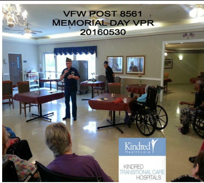
VFW POST 8561 MEMORIAL DAY VPR 20160530

Kindred Healthcare KINDRED TRANSITIONAL CARE HOSPITALS