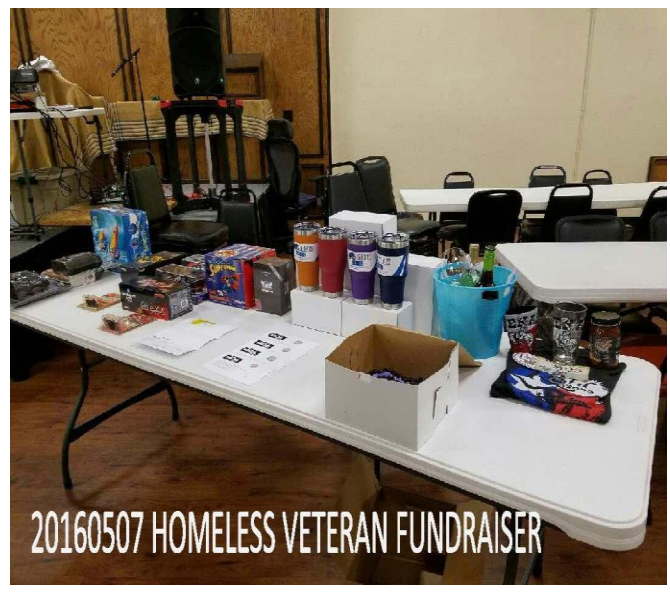
20160507 HOMELESS VETERAN FUNDRAISER