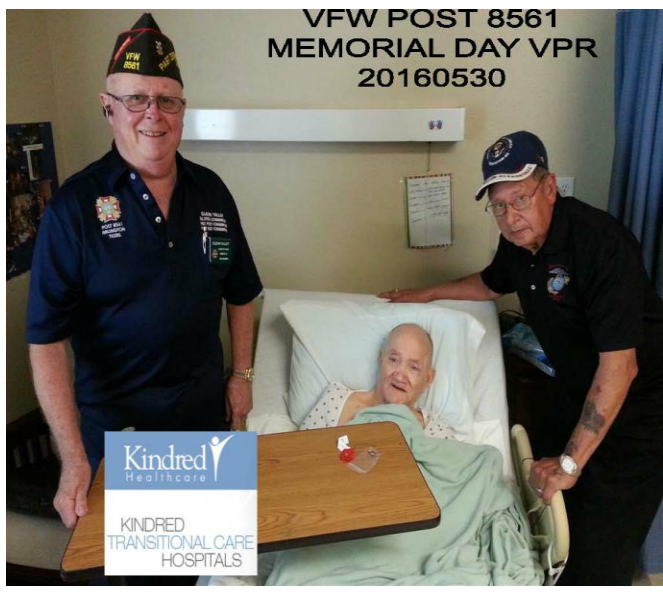
VFW POST 8561 MEMORIAL DAY VPR 20160530

Kindred Healthcare KINDRED TRANSITIONAL CARE HOSPITALS