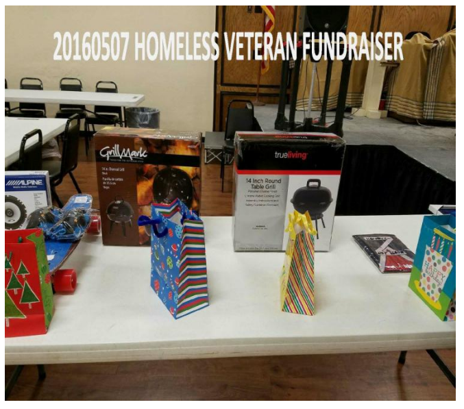
20160507 HOMELESS VETERAN FUNDRAISER