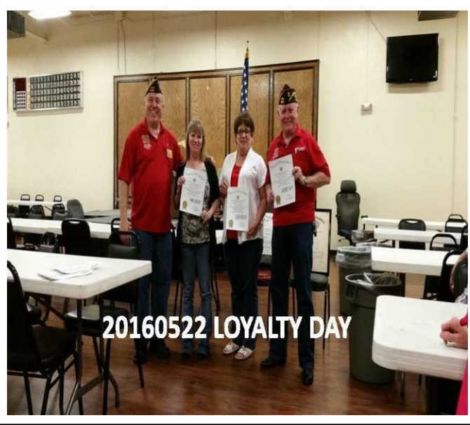
20160522 LOYALTY DAY