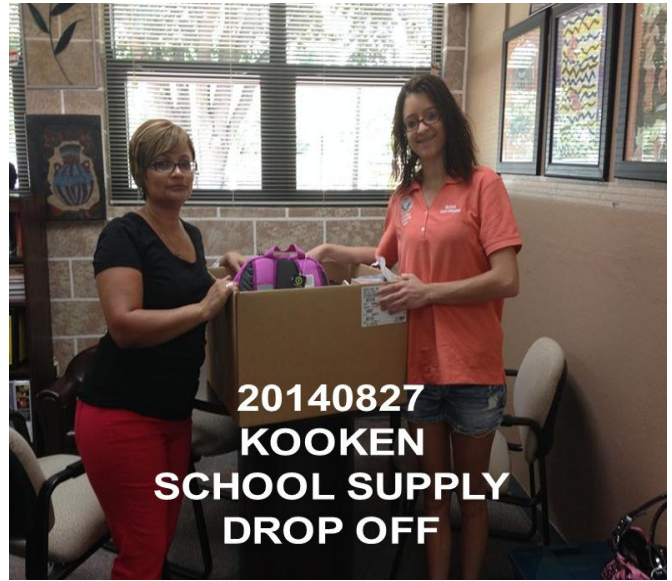
20140827 KOOKEN SCHOOL SUPPLY DROP OFF