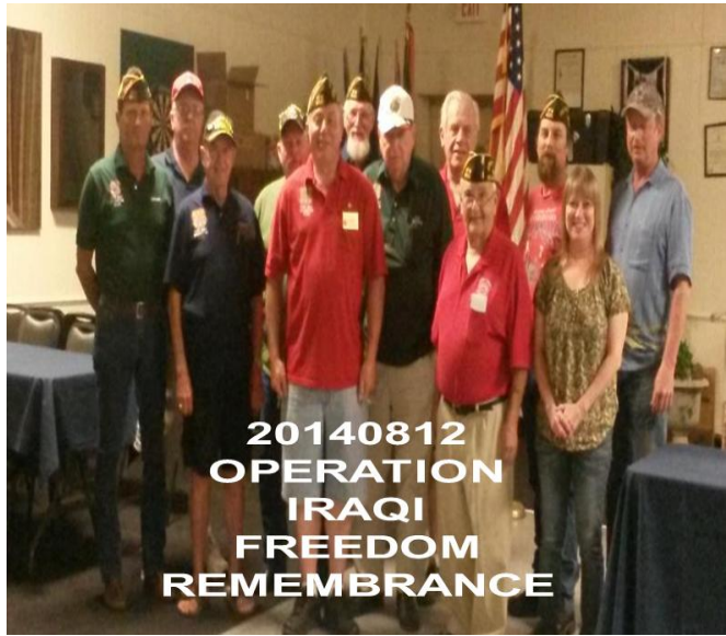
20140812 OPERATION IRAQI FREEDOM REMEMBRANCE

VFW POST 8561 3221 HOWELL ST. ARL TX. 817 633 8332 HTTP://WWW.VFWPOST8561.ORG