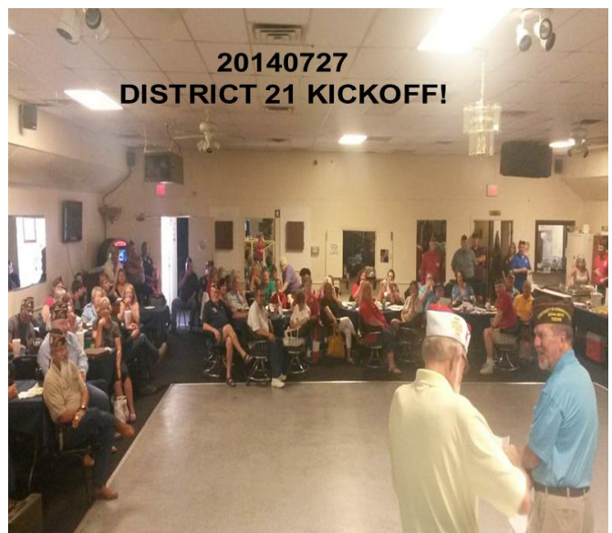
20140727 DISTRICT 21 KICKOFF!