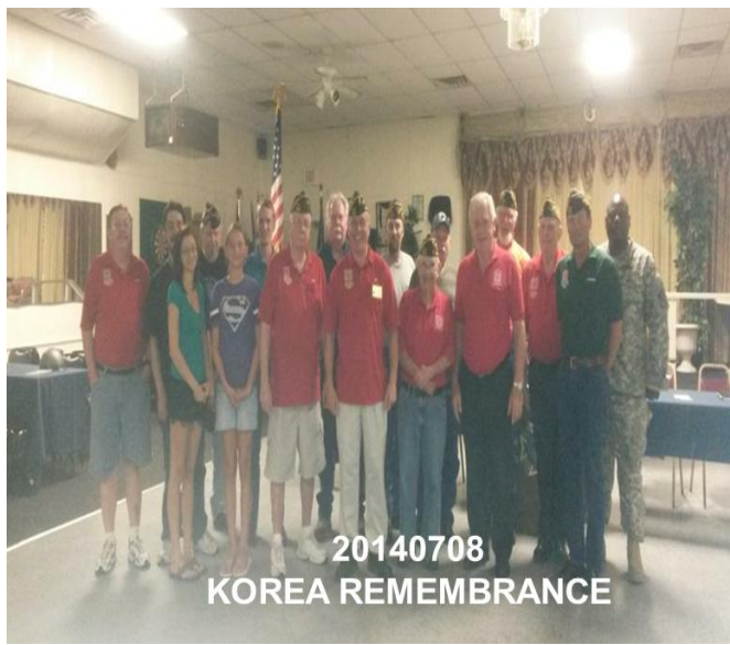
20140708 KOREA REMEMBRANCE