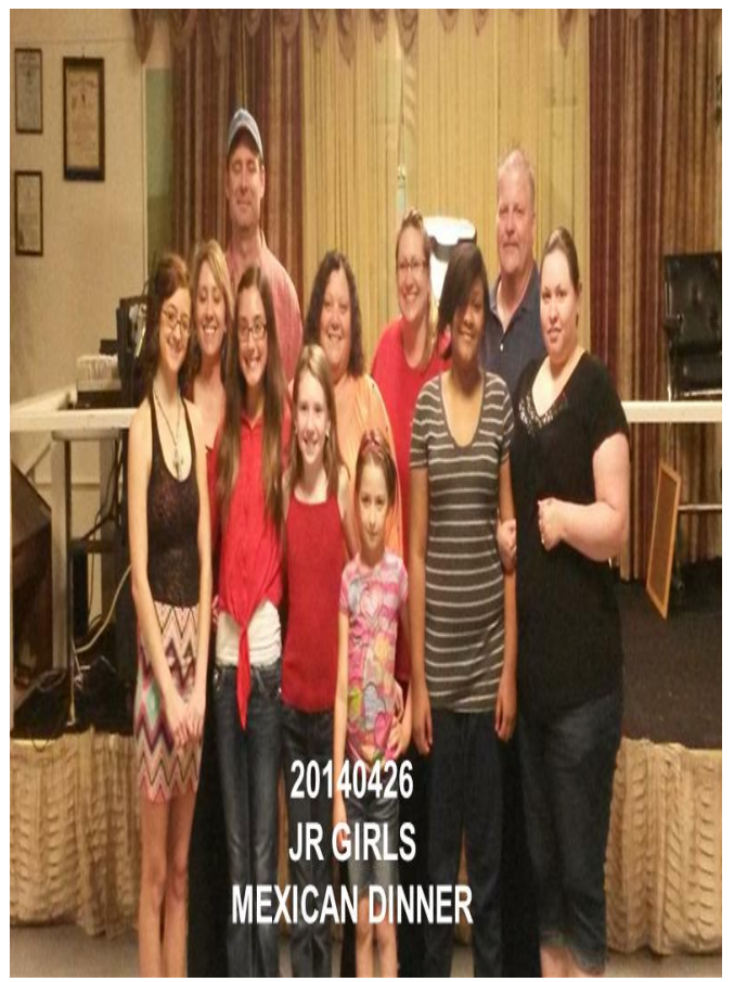
20140426 JR GIRLS MEXICAN DINNER