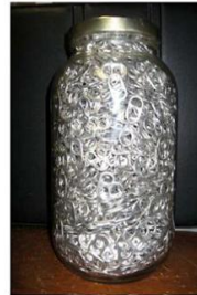
NOT ACTUAL JAR

"Guess How Many Pull Tabs Are In The Jar"