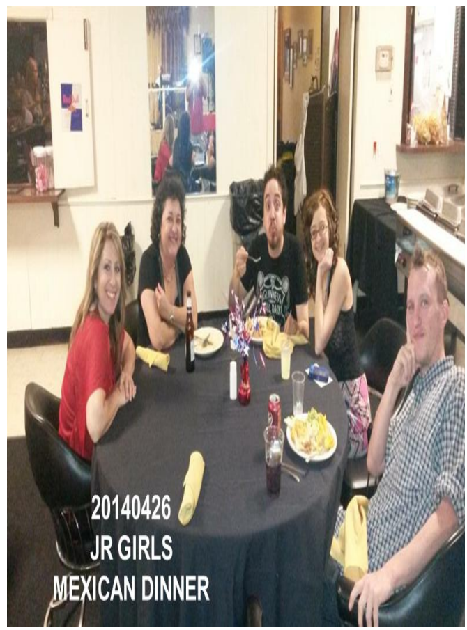
20140426 JR GIRLS MEXICAN DINNER