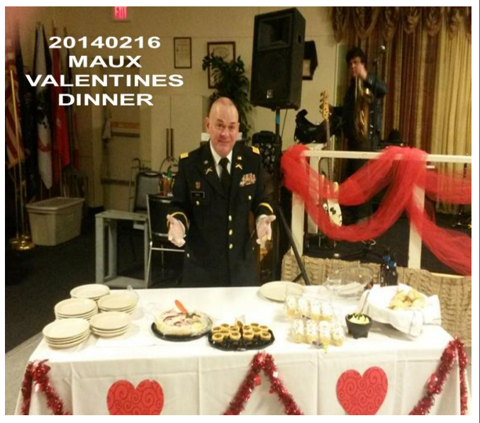
20140216 MAUX VALENTINES DINNER