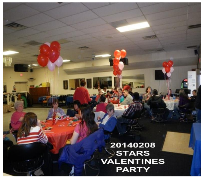
20140208 STARS VALENTINES PARTY