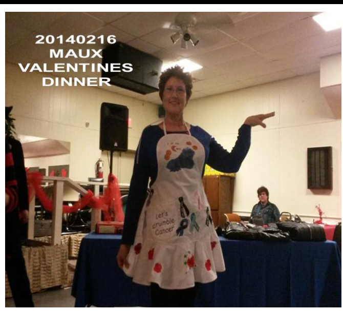
20140216 MAUX VALENTINES DINNER