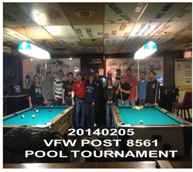
20140205 VFW POST 8561 POOL TOURNAMENT