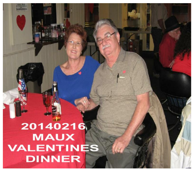
20140216 MAUX VALENTINES DINNER