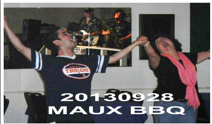
20130928 MAUX BBQ