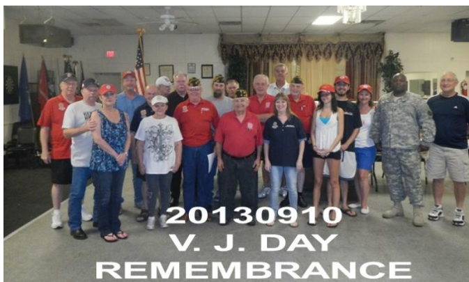
20130910 V. J. DAY REMEMBRANCE