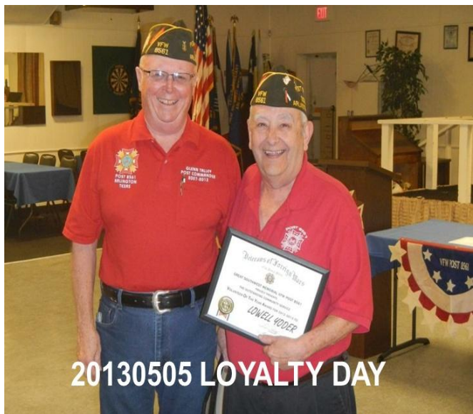
20130505 LOYALTY DAY

3221 HOWELL ST. ARL. SUNDAY - 23 JUN 13 | 0900 -1130 $5 http://www.vfwpost8561.org