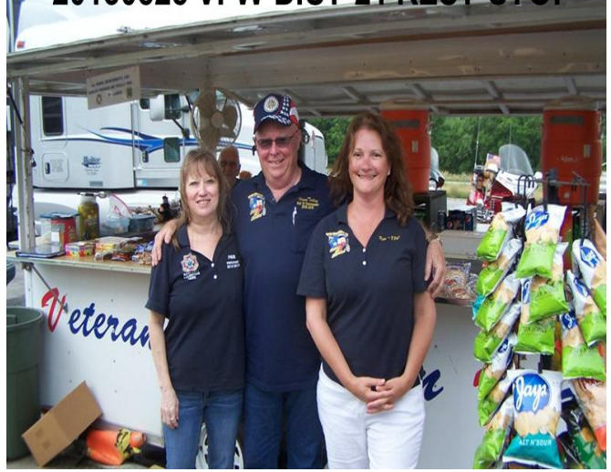
20130525 VFW DIST 21 REST STOP