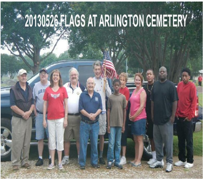
20130526 FLAGS AT ARLINGTON CEMETERY