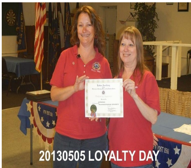
20130505 LOYALTY DAY