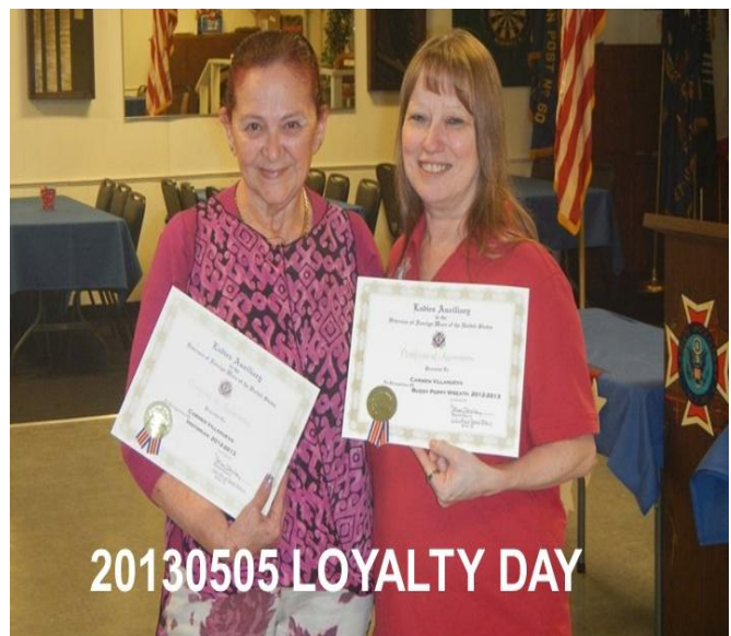
20130505 LOYALTY DAY