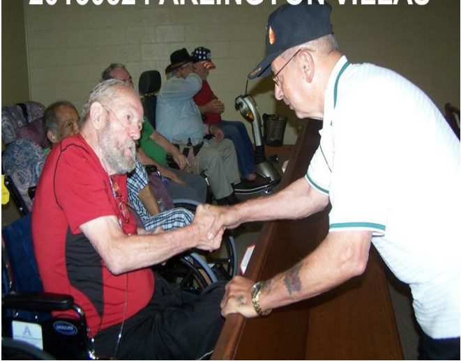
20130524 ARLINGTON VILLAS