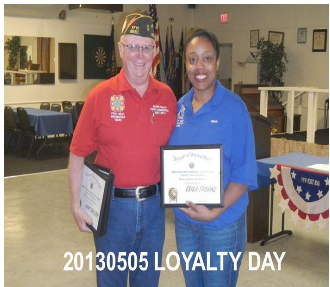
20130505 LOYALTY DAY