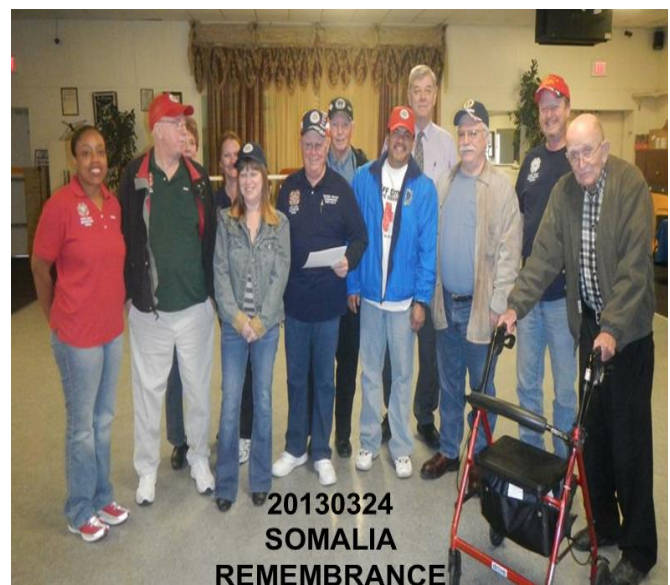
20130324 SOMALIA REMEMBRANCE