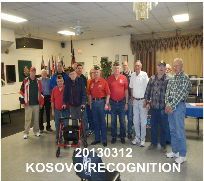
20130312 KOSOVO RECOGNITION