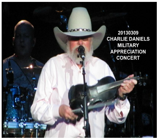
20130309 CHARLIE DANIELS MILITARY APPRECIATION CONCERT