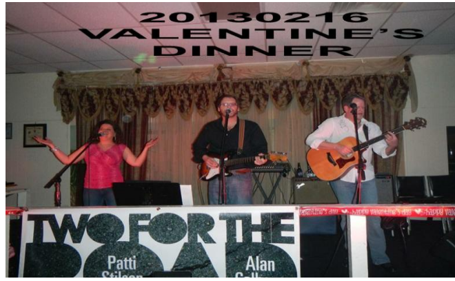
20130216 VALENTINE'S DINNER

VFW 8561 Ladies Auxiliary $100 A DAY RAFFLE