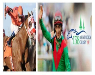
KENTUCKY DERBY SATURDAY 05 MAY 2012 POST TIME AT YOUR POST!