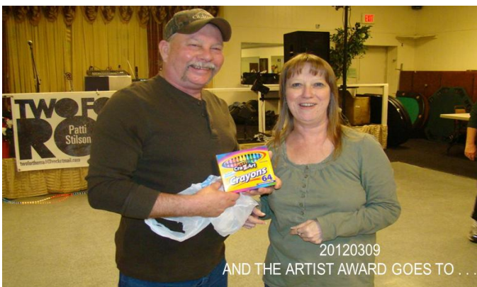
20120309 AND THE ARTIST AWARD GOES TO . . .