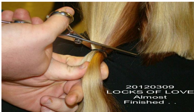
20120309 LOCKS OF LOVE Almost Finished . .