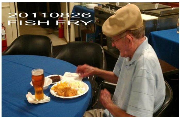
20110826 FISH FRY