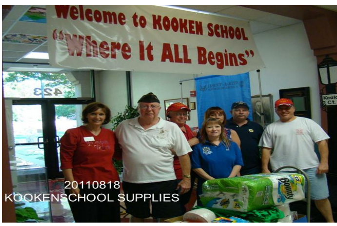
20110818 KOOKEN SCHOOL SUPPLIES