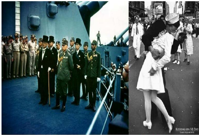
KISSING ON VJ Day