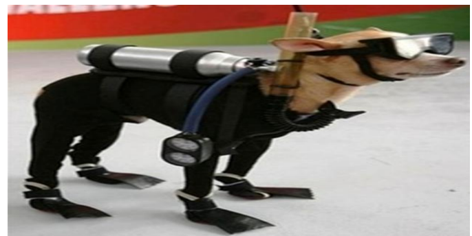
RARE PHOTO MEXICAN NAVY SEAL