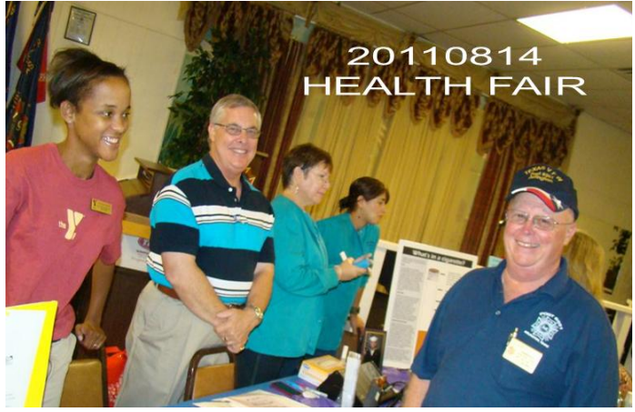
20110814 HEALTH FAIR