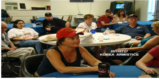
20110727 KOREA ARMISTICE