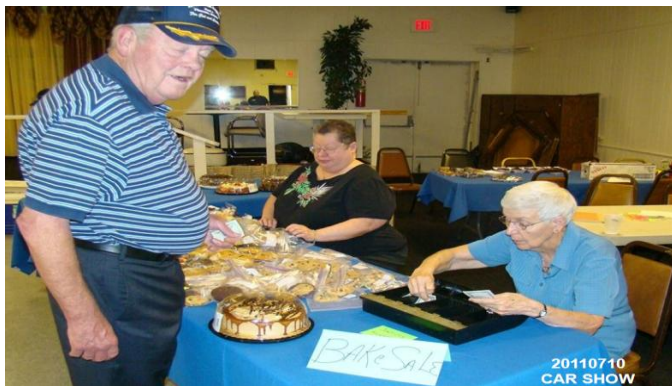
20110710 CAR SHOW