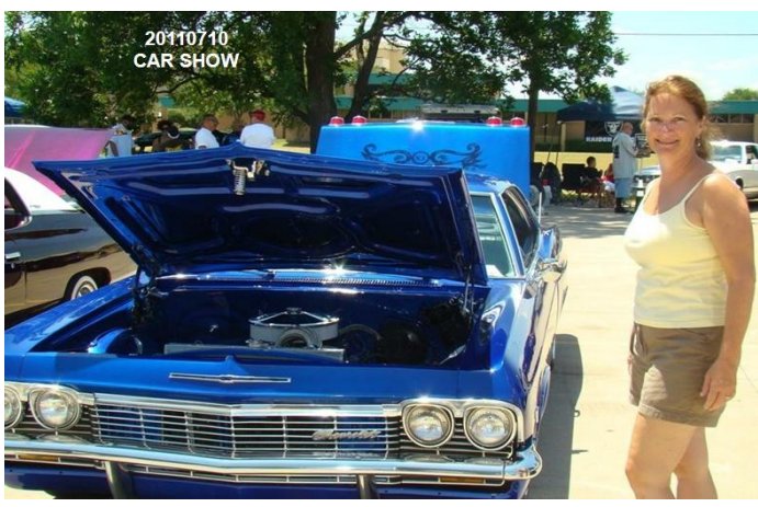
20110710 CAR SHOW