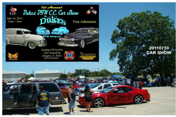
1st Annual Dukes DFW C.C. Car Show July 10, 2011 12pm - 5pm Free Admission DFW Chapter Bonsing VFW Post 8561 3221 Howell St. Arlington, TX 76010 (817) 633-9332