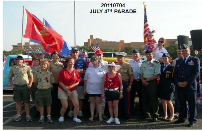
20110704 JULY 4 TH PARADE