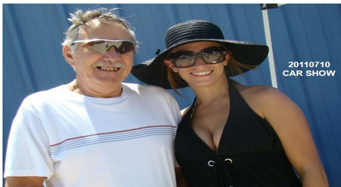
20110710 CAR SHOW