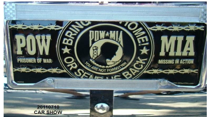
20110710 CAR SHOW