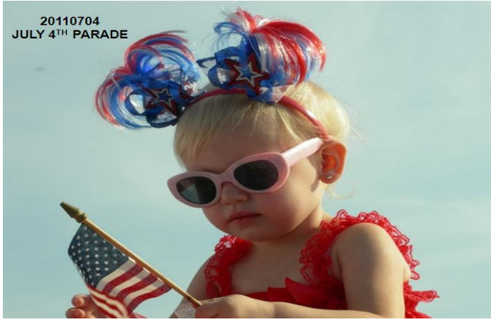
20110704 JULY 4 TH PARADE