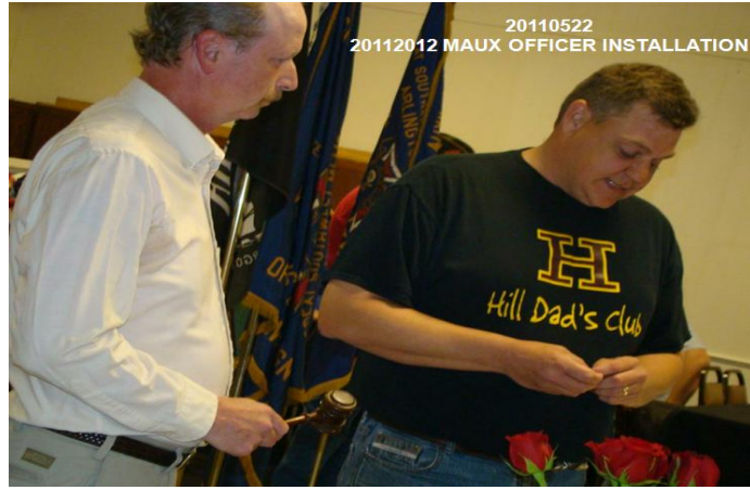
20110522 20112012 MAUX OFFICER INSTALLATION