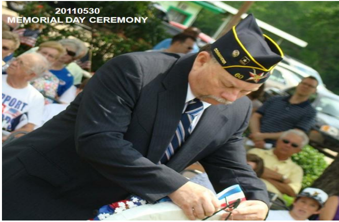
20110530 MEMORIAL DAY CEREMONY