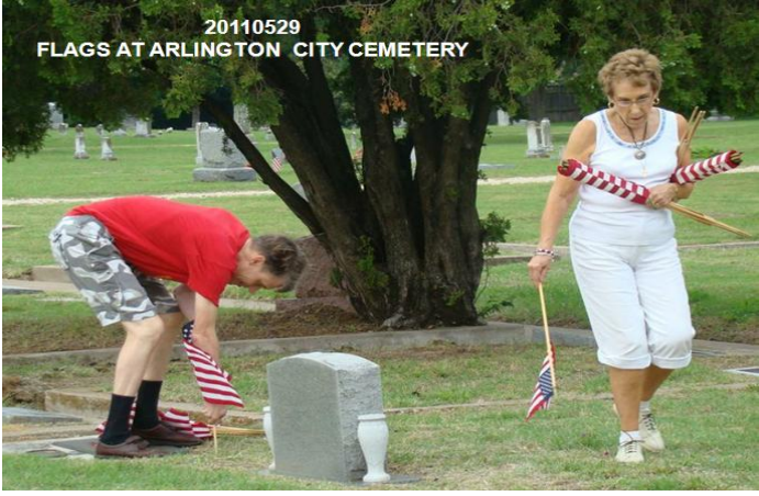
20110529 FLAGS AT ARLINGTON CITY CEMETERY