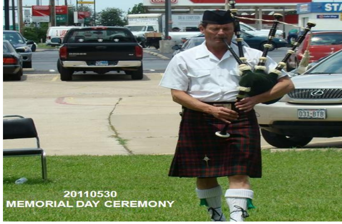
20110530 MEMORIAL DAY CEREMONY