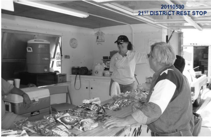
20110530 21 ST DISTRICT REST STOP