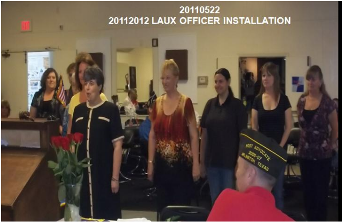
20110522 20112012 LAUX OFFICER INSTALLATION