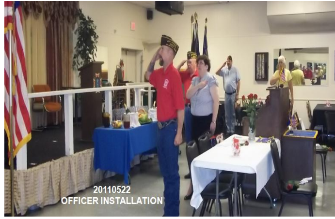
20110522 OFFICER INSTALLATION