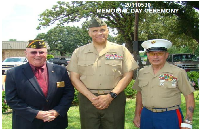
20110530 MEMORIAL DAY CEREMONY